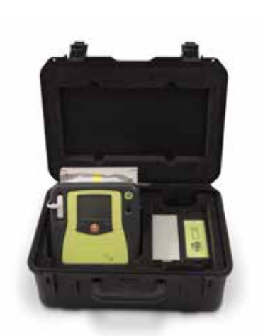
Hard-shell Carry Case Hard-shell case with foam cutouts.