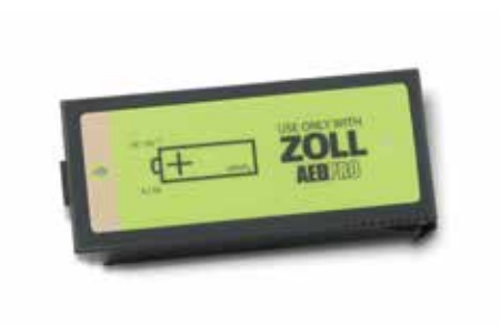
AED Pro Non-rechargeable Lithium-ion Pack

5-year maximum usable life. Cannot be recharged.