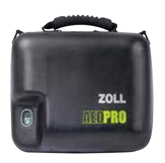
AED Pro Molded Vinyl Case